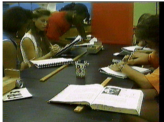
Figure 1: Traditional hands-on activities as well as interactive multimedia are used in the explorations and applications.

The applications are graded on a scale of 0 to 8. In this case, grades are based on the students' abilities to use physics concepts in their explanations and to use those quantitative relationships presented in the class and text.